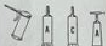
OMC TYPE "A" TYPE "C" DRAIN OIL