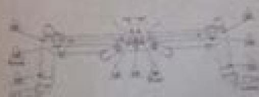
Fig. 11 Reference numbers of Lubrication