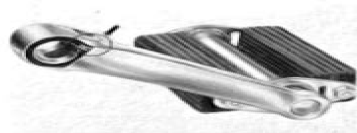
Abb. 9 Kennzeichnung der Tretkurbeln (kann auch am anderen Kurbelende sein)