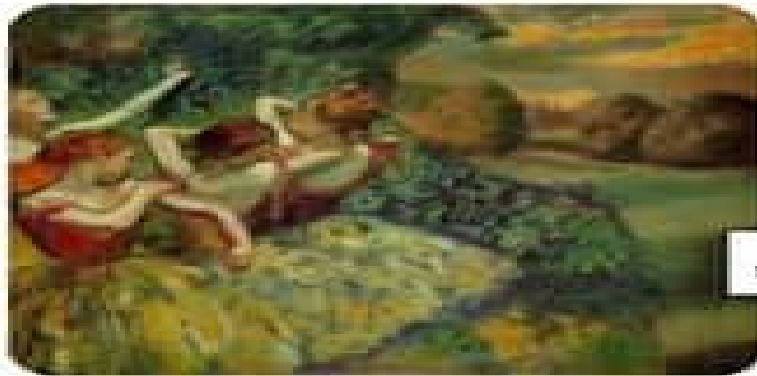
Four Dancers by, Edgar Degas 1890