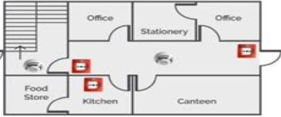
L4 FIRE ALARM SYSTEM